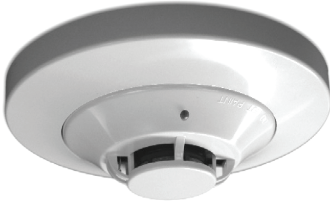
Model MIX-2251TB Detector Mounted in a Model MIX-B210LP Base